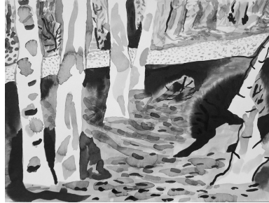
Carl Baratta, Bronson Picnic Area , 2018 Sumi ink on paper 9 x 12 in. (22.9 x 30.5 cm)