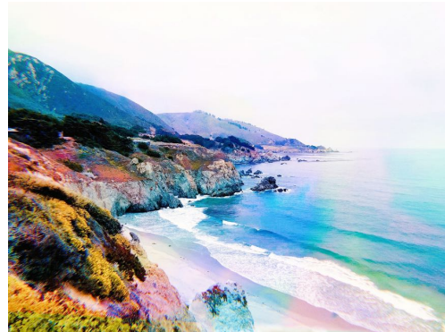
Olivia D'Orazi, Rainbow Shores , 2020 Giclée print, Edition of 10 18 x 24 in. (45.7 x 61 cm)

Open Mind Art Space is pleased to announce an exclusive online exhibition, Golden State of Mind , featuring new photography by returning artist Olivia D'Orazi. The online viewing room will open on Artsy on Thursday, November 19th at 12:00pm P.S.T., and will be on view online only through December 4, 2020, at the following URLs: https://bit.ly/viewing-room-oliviadorazi and https://bit.ly/artsy-golden-state-of-mind